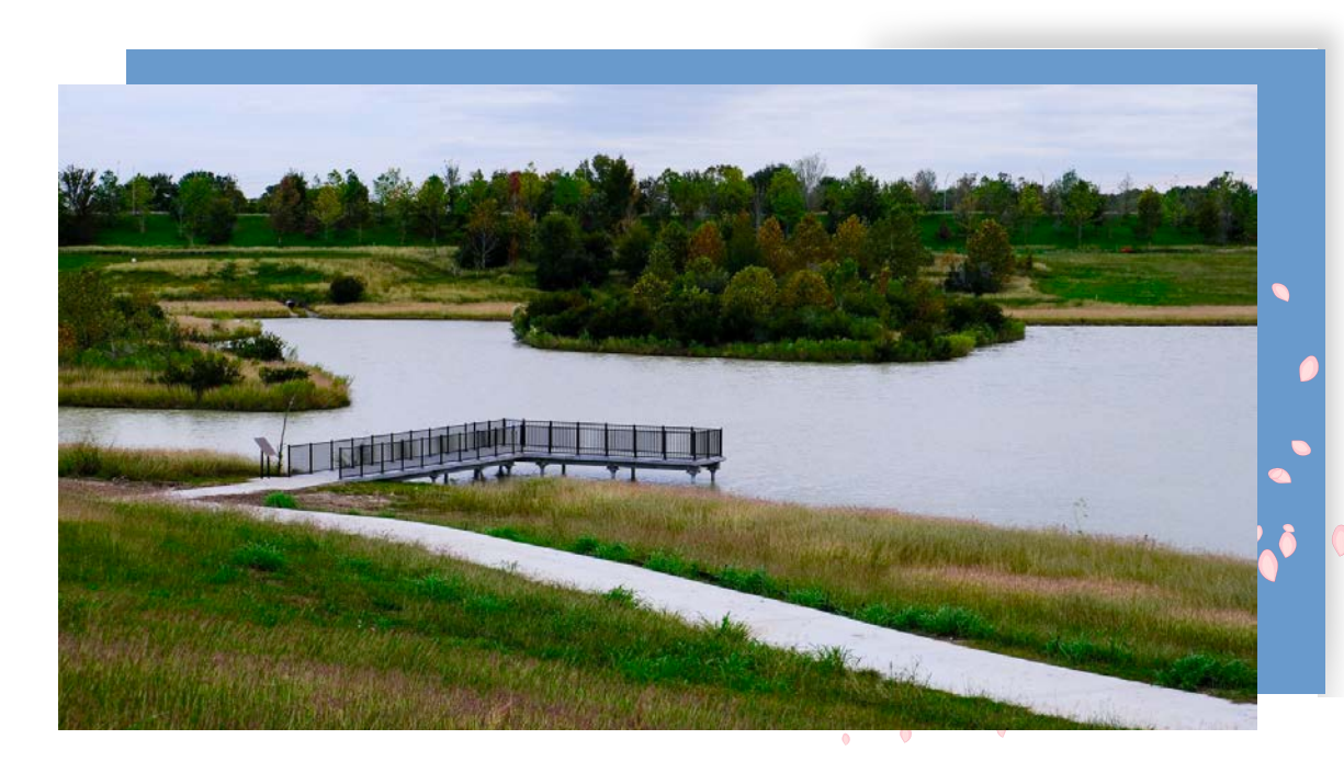
A $7500 grant has been awarded by the Bellaire Rotary Club for the installation of two park benches at the pier.