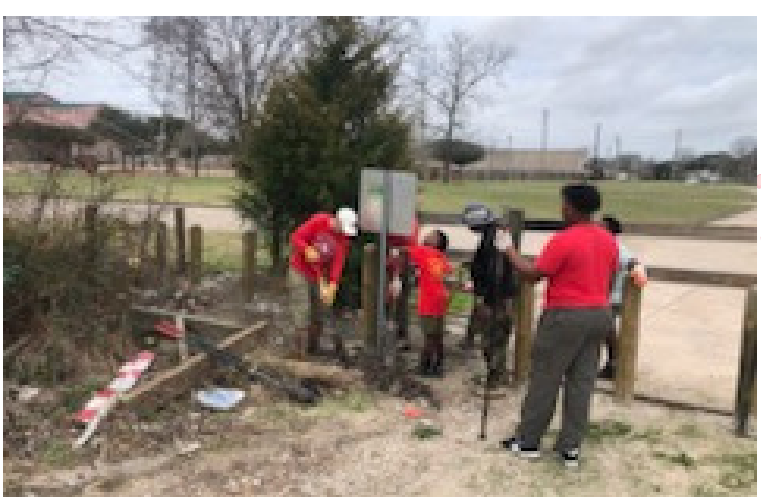
Troop 601 - New Faith Church