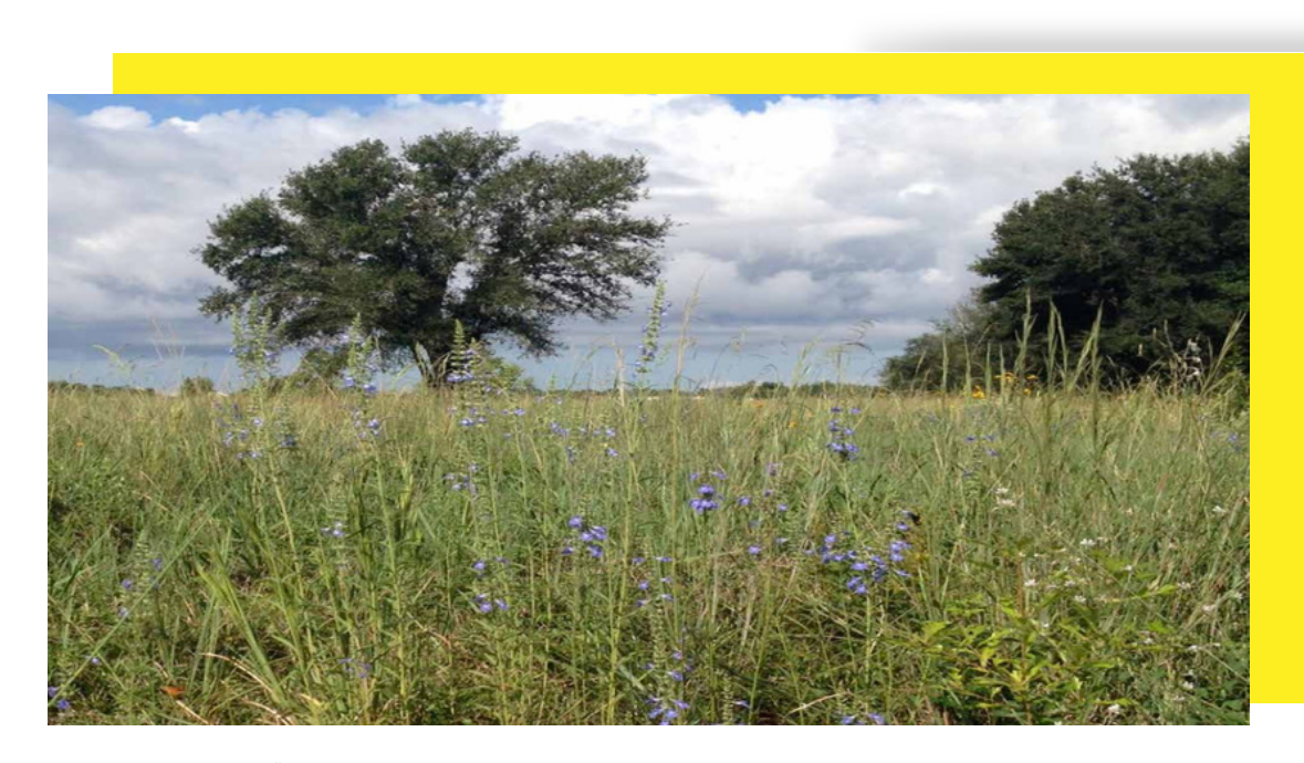
A grant of $25,000 has been awarded by the River Oaks Garden Club to support the environmentally sensitive development of the Coastal Prairie Preserve.